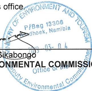
Fredrick Mupoti Sikabongo DEPUTY ENVIRONMENTAL COMMISSIONER