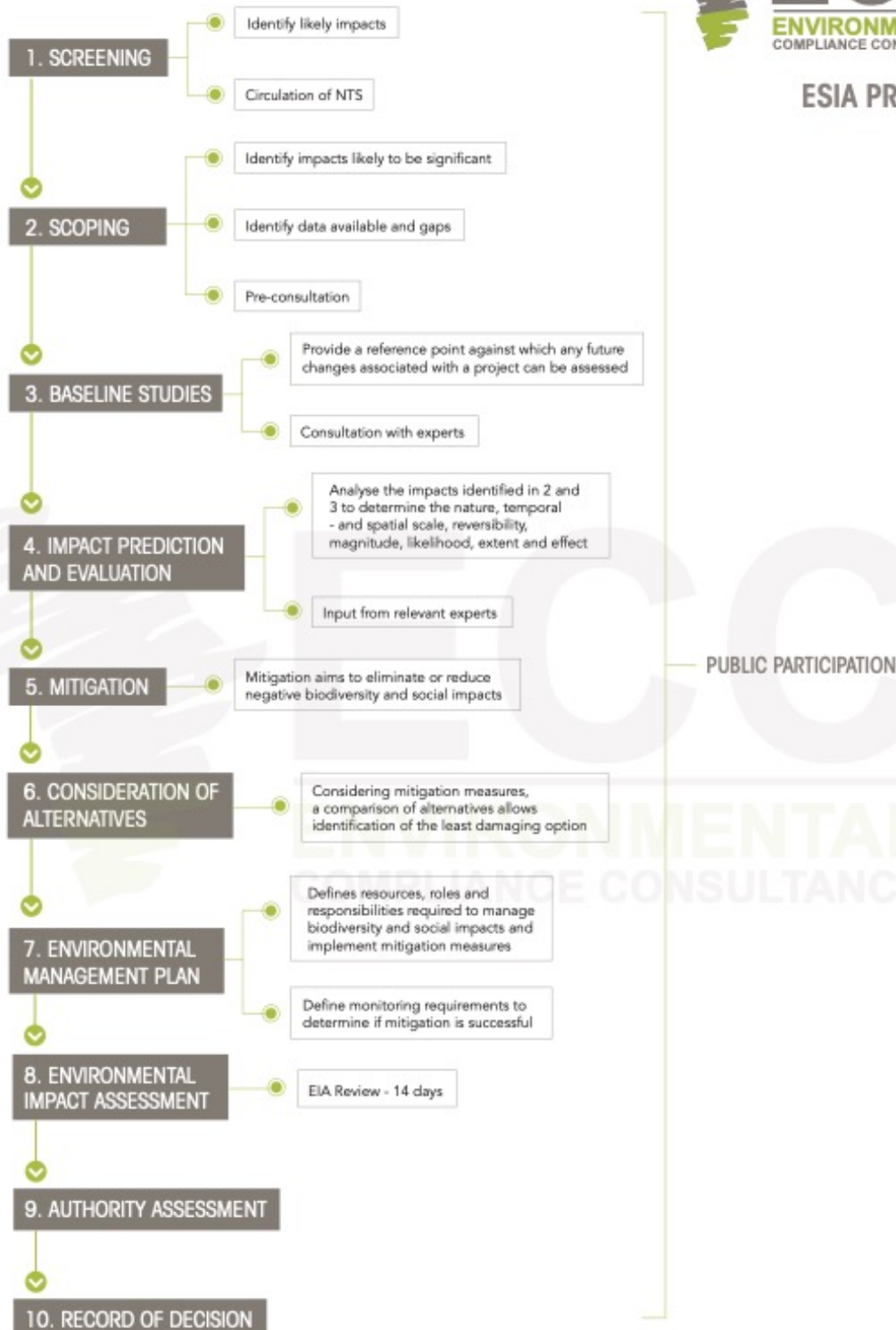
Figure 2 - Flowchart of the environmental and social assessment process