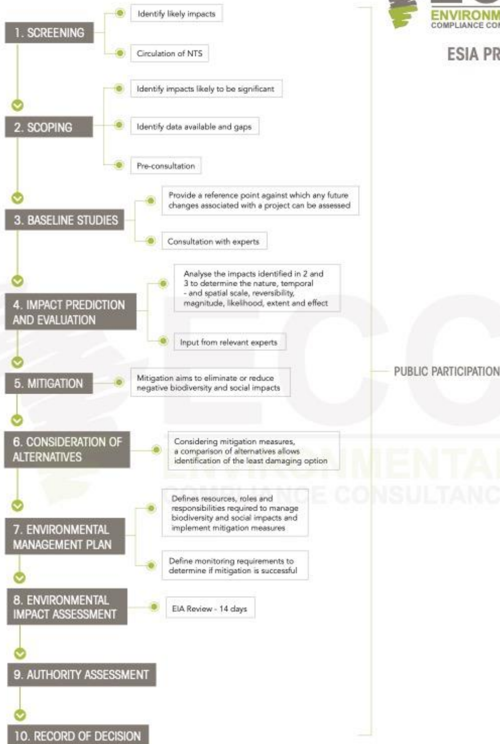
Figure 2 – Flowchart of the environmental and social assessment process