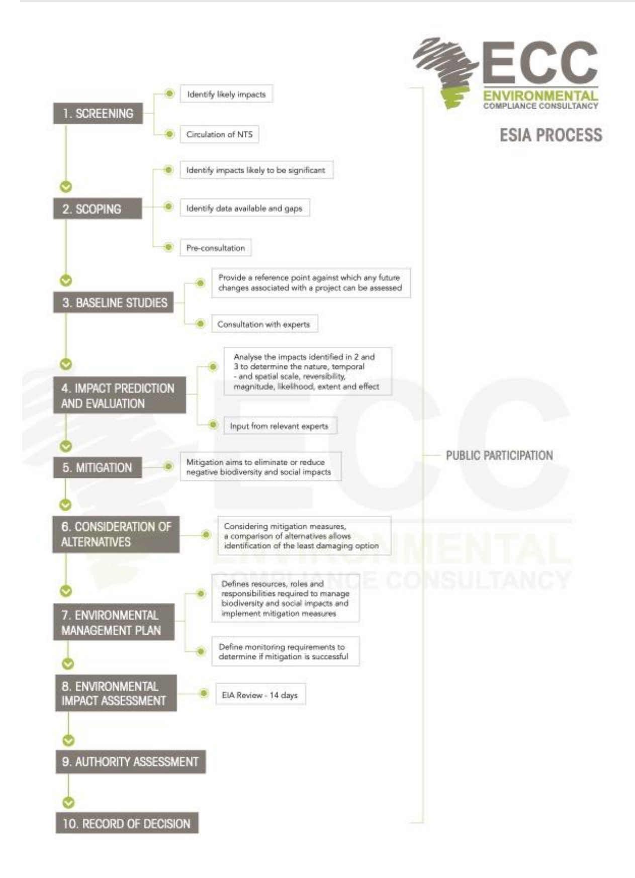
Figure 2 - Flowchart of the environmental and social assessment process