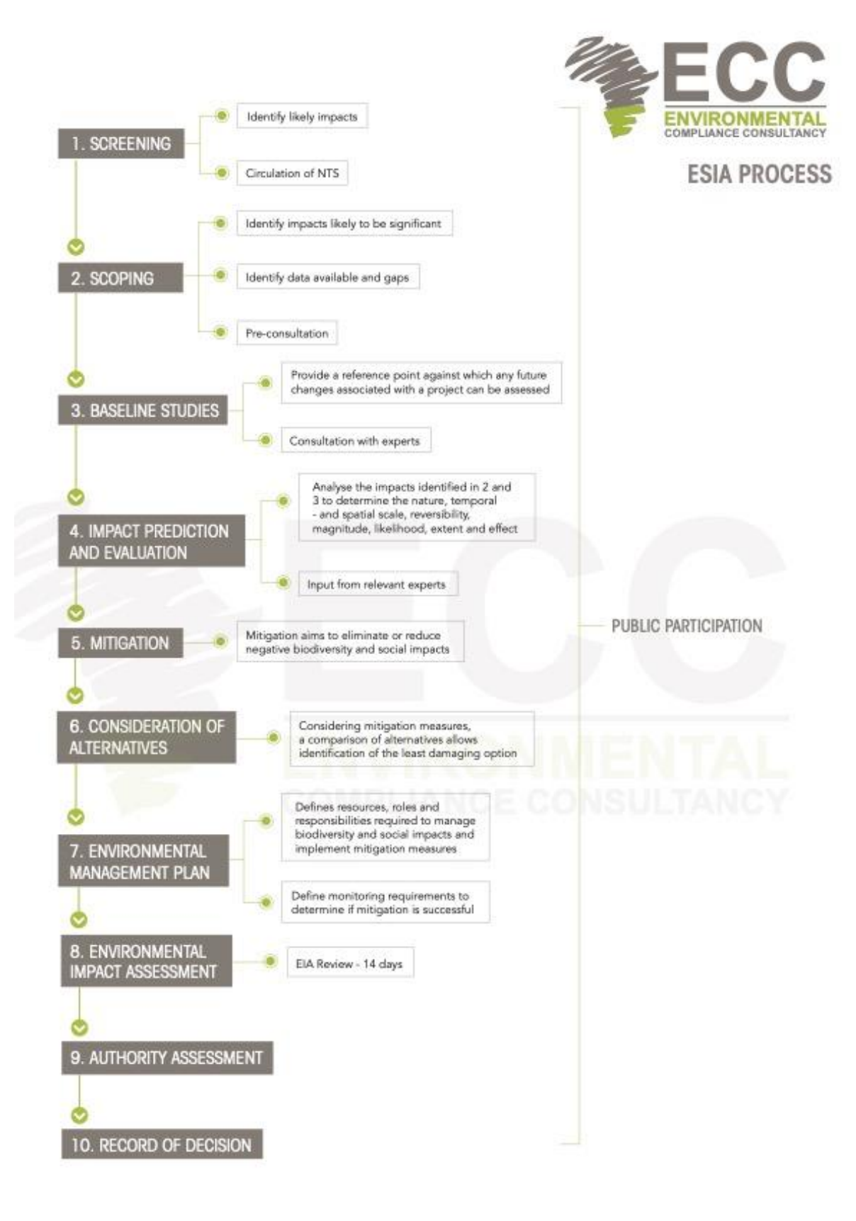
Figure 2 - Flowchart of the environmental and social assessment process