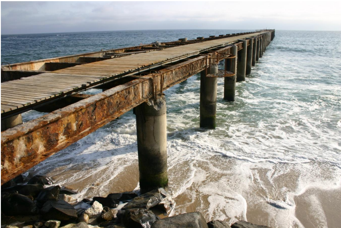
The steel jetty after restoration in 1998