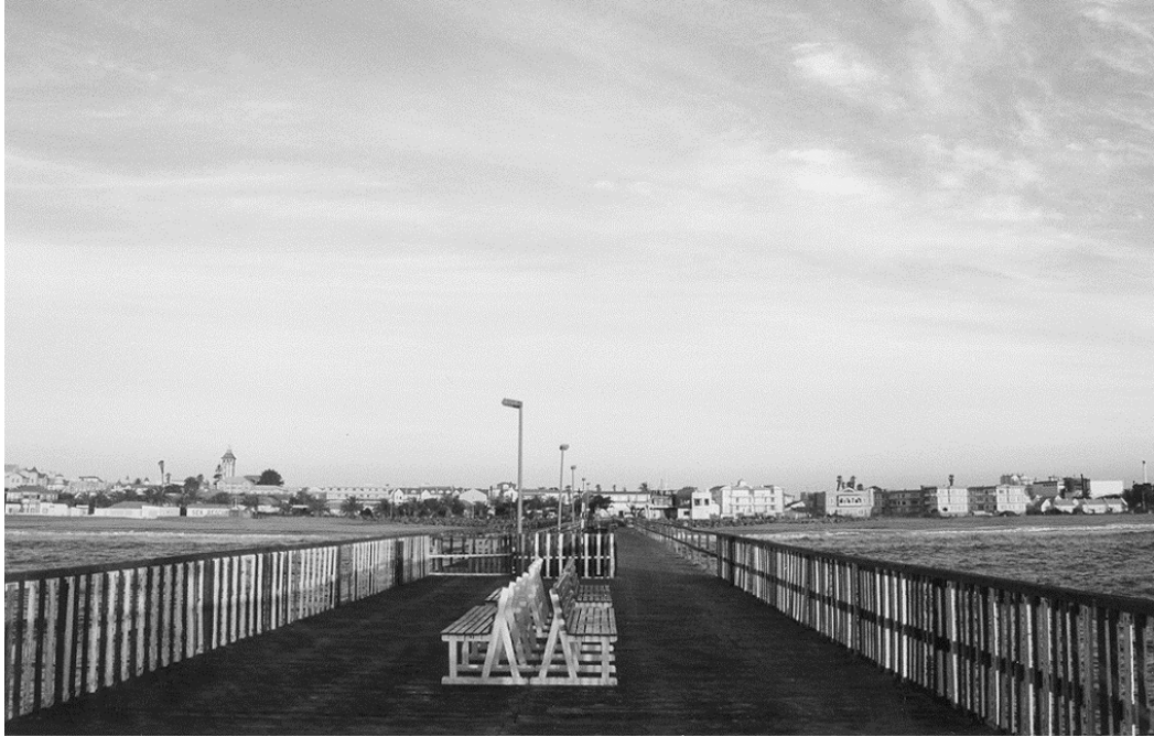
The head of steel the jetty app. 1998