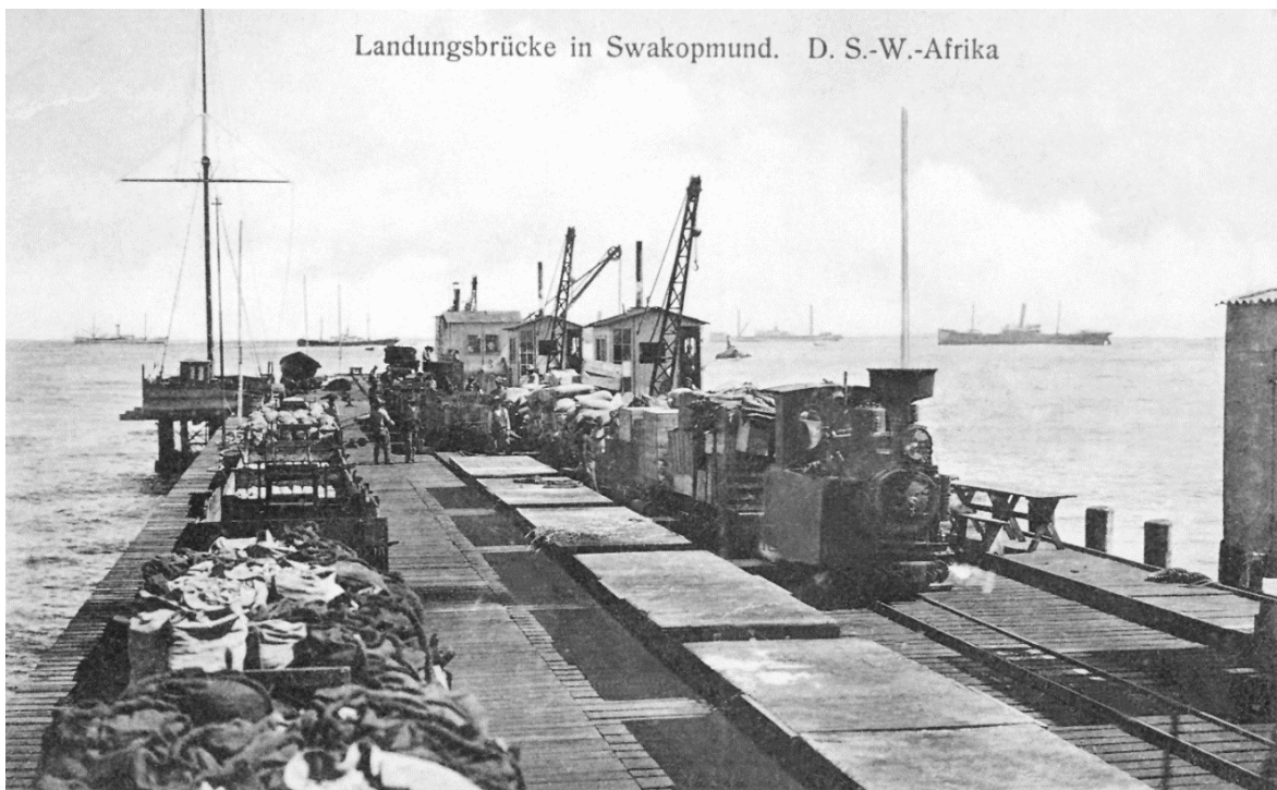
The old wooden jetty with its three steam cranes and railway tracks