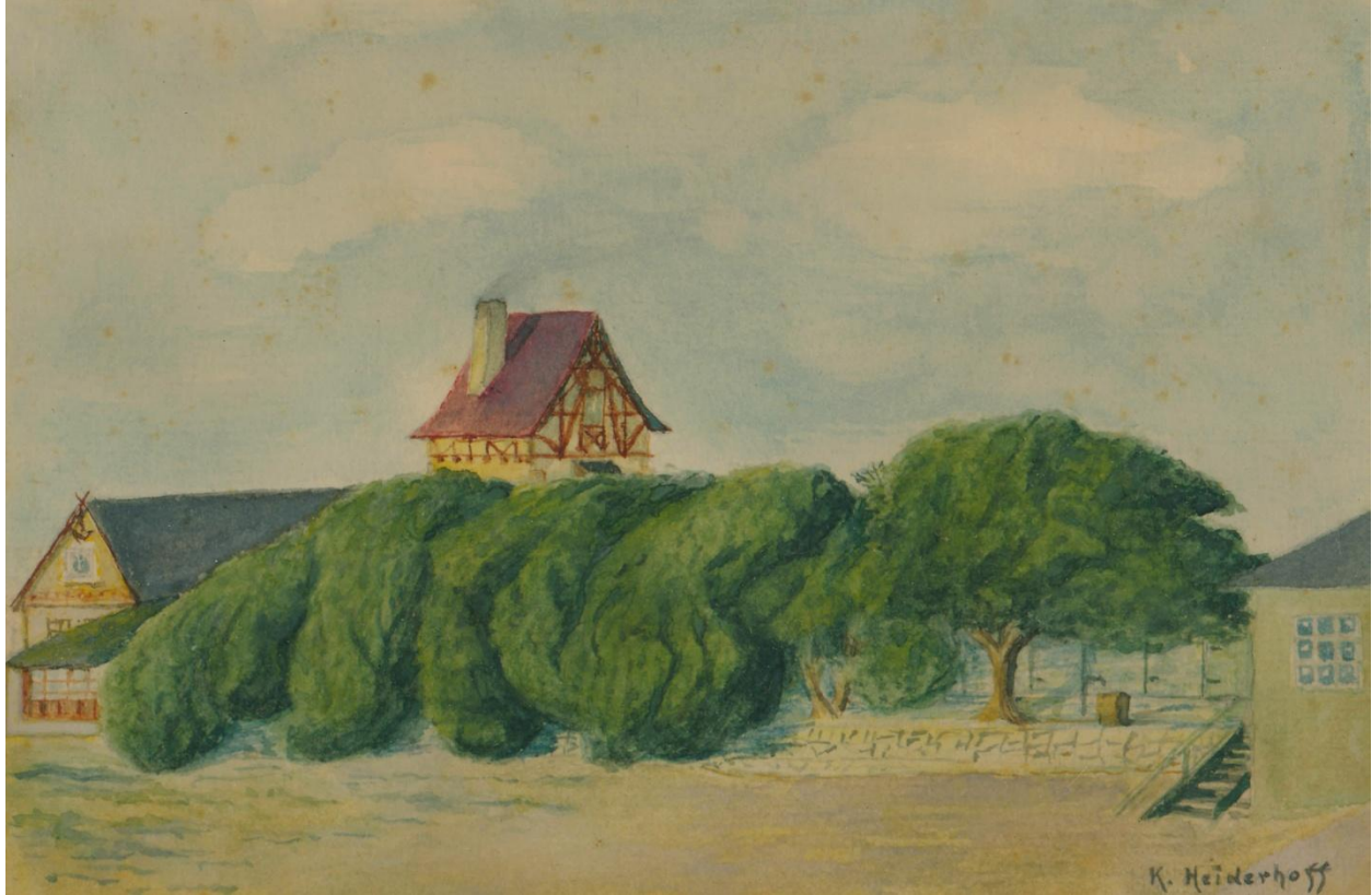
Artist's impression of the old Badehaus, probably in the 1960's