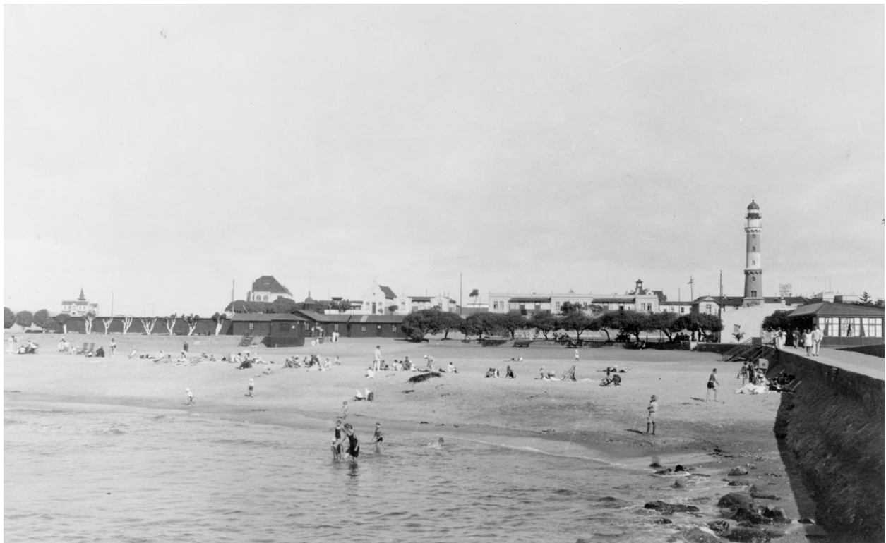
Holiday makers in the old harbour mole basin, with the Swakopmund railway station at the back (left), the Altes Amtsgericht, the changing cabins and the beach supervisor's office, the lighthouse and the old Strand Café (app. 1930).