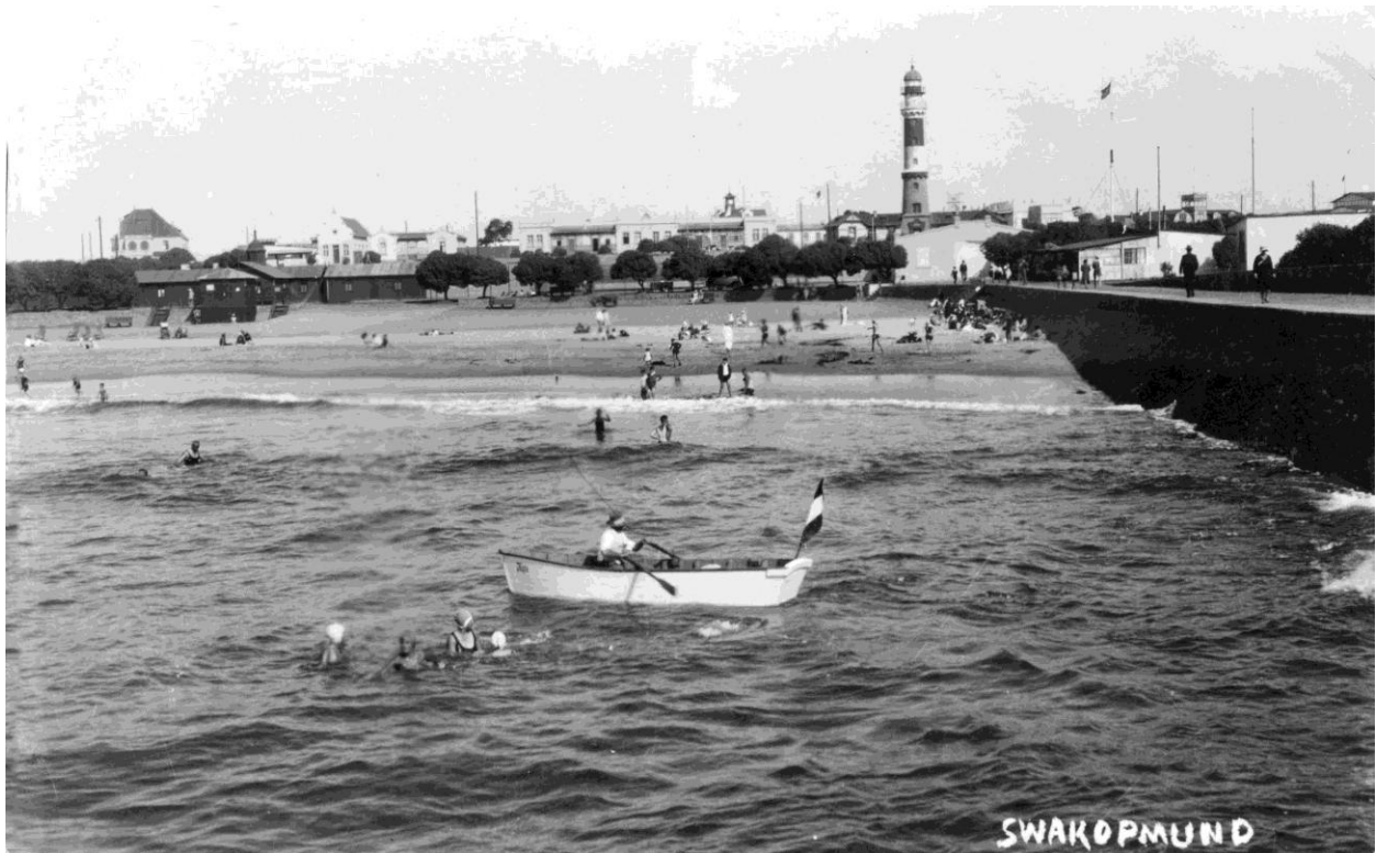
The old harbour mole basin (app. 1930)