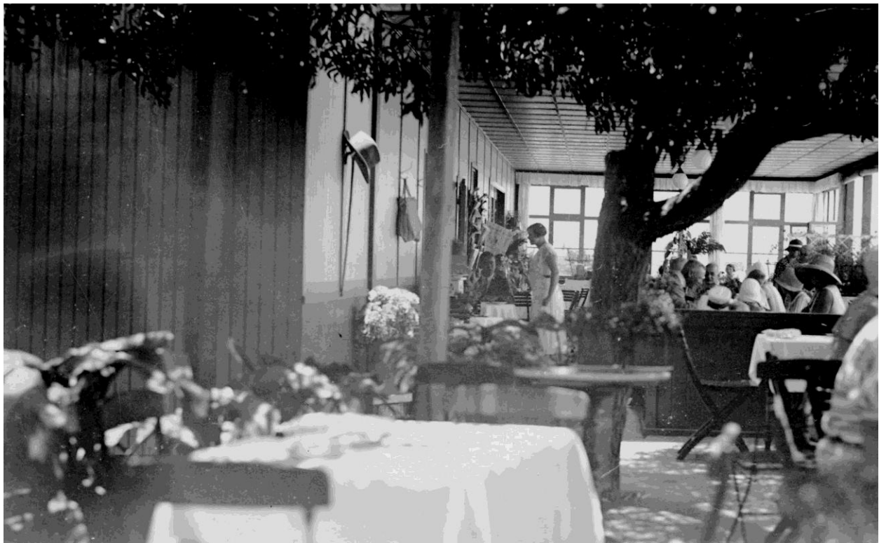
Inside the old Strand Café (app. 1930)