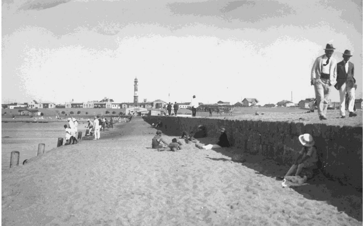
The old harbour mole (app. 1930)