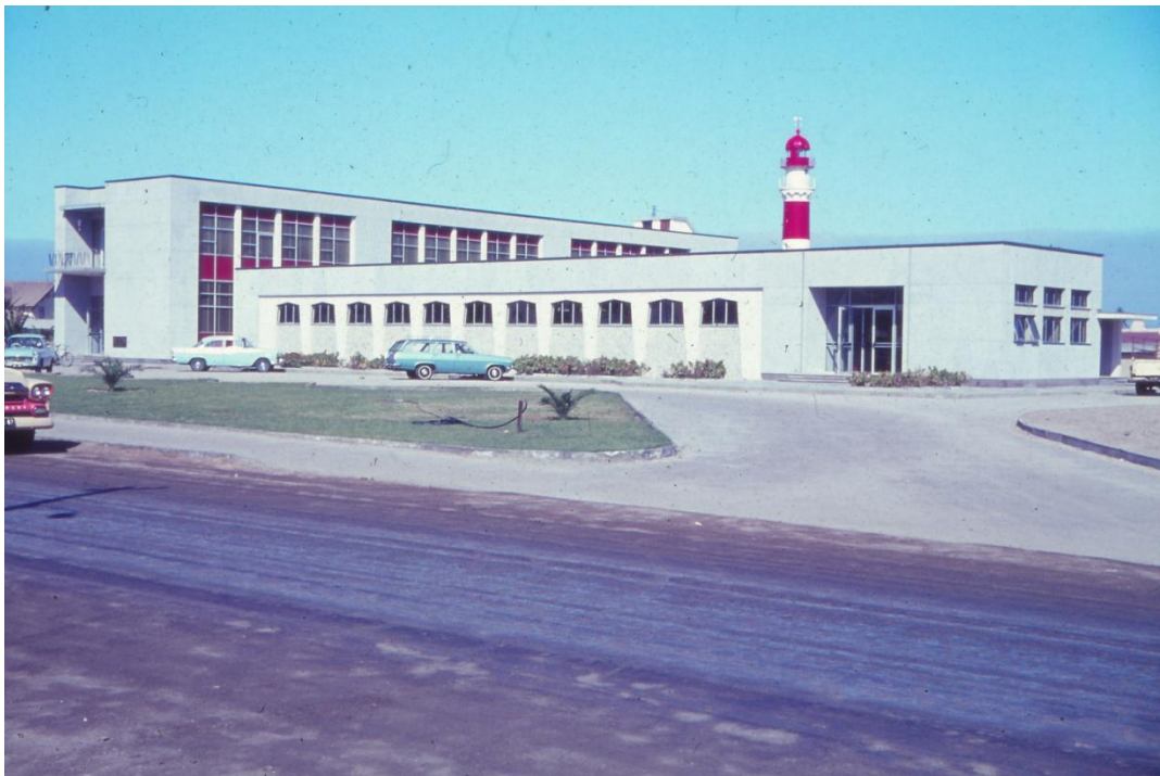
The new Magistrate's Offices (app. 1960)