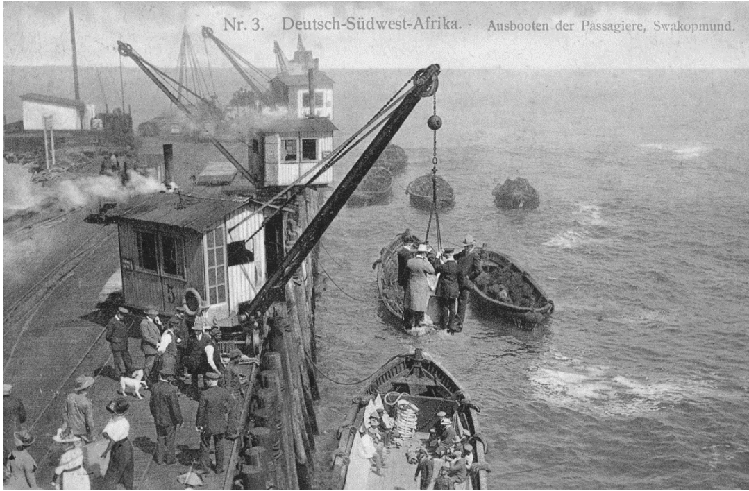
The old wooden jetty with its three steam cranes