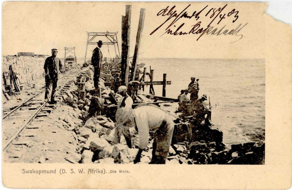
Construction of the harbour mole in 1903