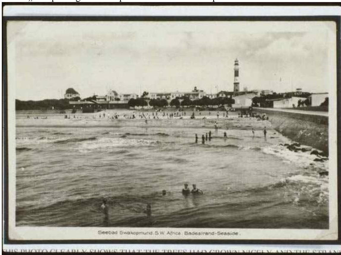
THIS PHOTO CLEARLY SHOWS THAT THE TREES HAD GROWN NICELY AND THE STRAN

„This photo gives an impression of the undeveloped area around the Mole.“