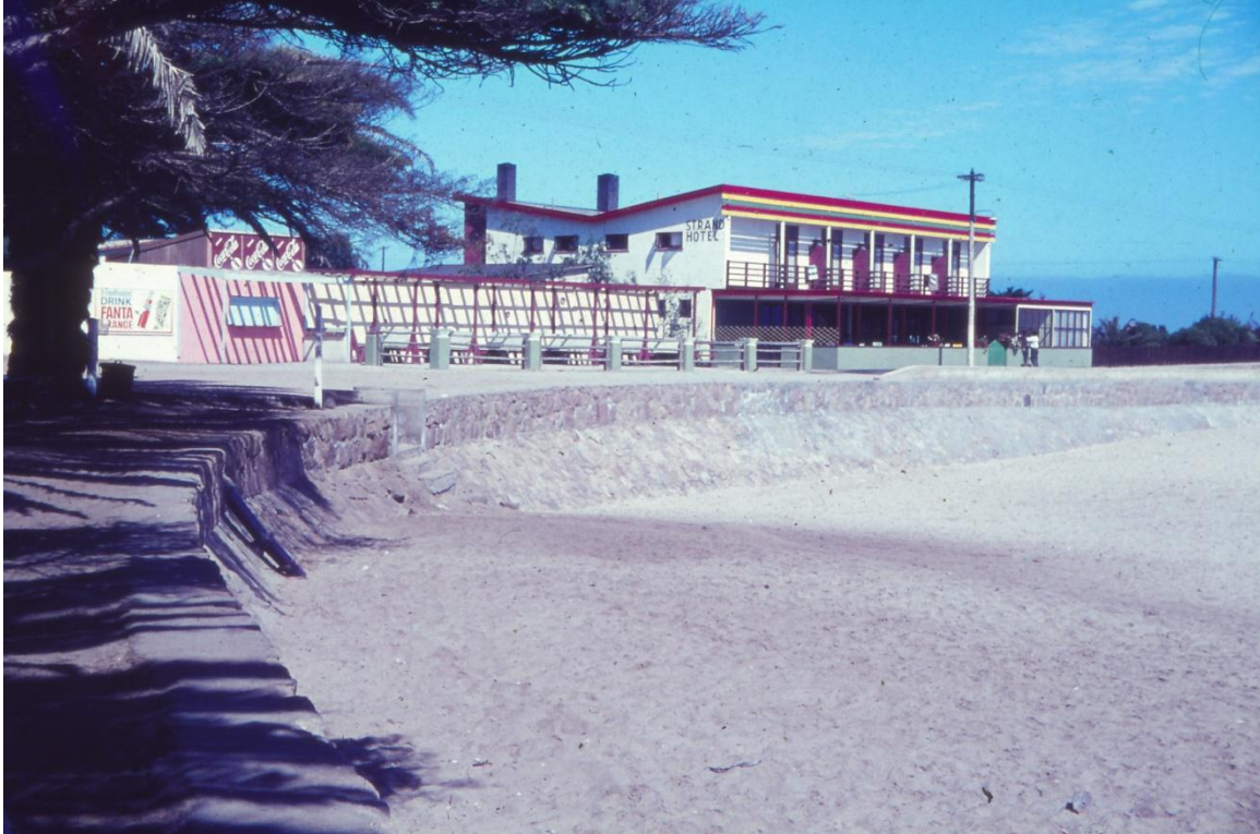
The old Strand Hotel (app. 1959)