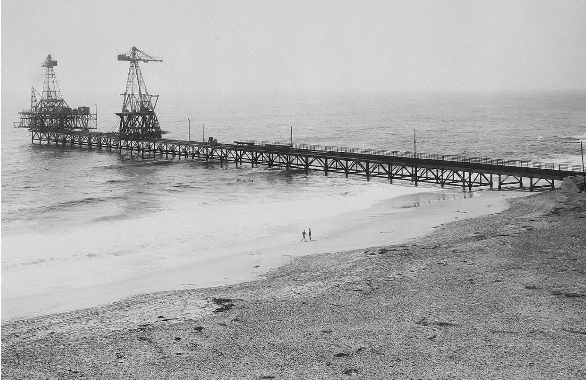
The new steel jetty, built as from 1913, abandoned in 1915 after the war.