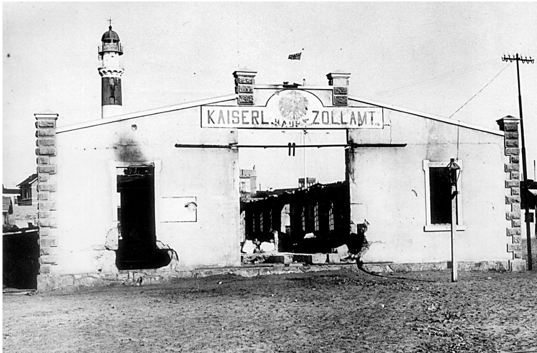
The old customs shed (“Kaiserliches Hauptzollamt”) between the mole and the lighthouse after its destruction by British shell fire during World War I. It was developed into the Swakopmund Museum in 1960.