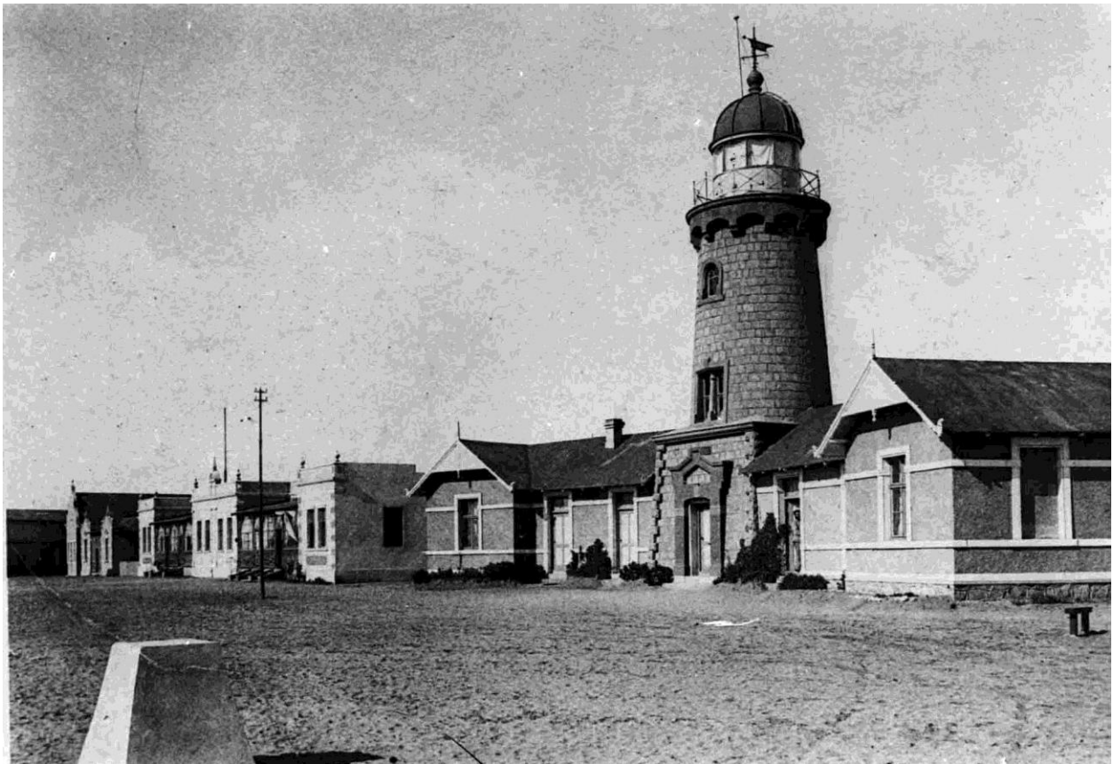
The old lighthouse before it was raised to its current height