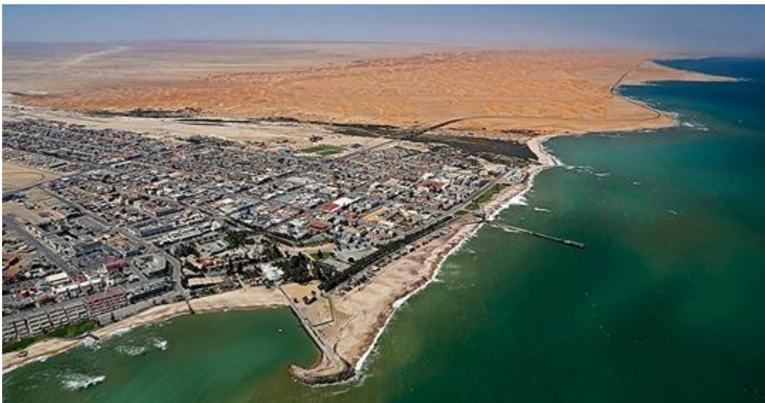
This more recent picture of Swakopmund prior to the building of the new Strand Hotel shows the exact same mole harbour basin with the Olympic-sized swimming pool featuring on Erf 4747, the condominium development in the foreground left, with the lighthouse, the old customs shed Swakopmund Museum, and the old harbour mole in the immediate foreground.