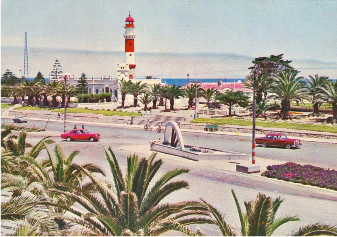
Swakopmund Lighthouse, Bezirksgericht, Intercontinental and Marines Monuments, app. 1970