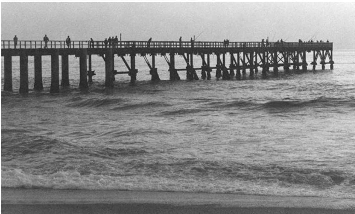
The rusted steel jetty (app. 1960), used by fishermen and people who took a walk there.