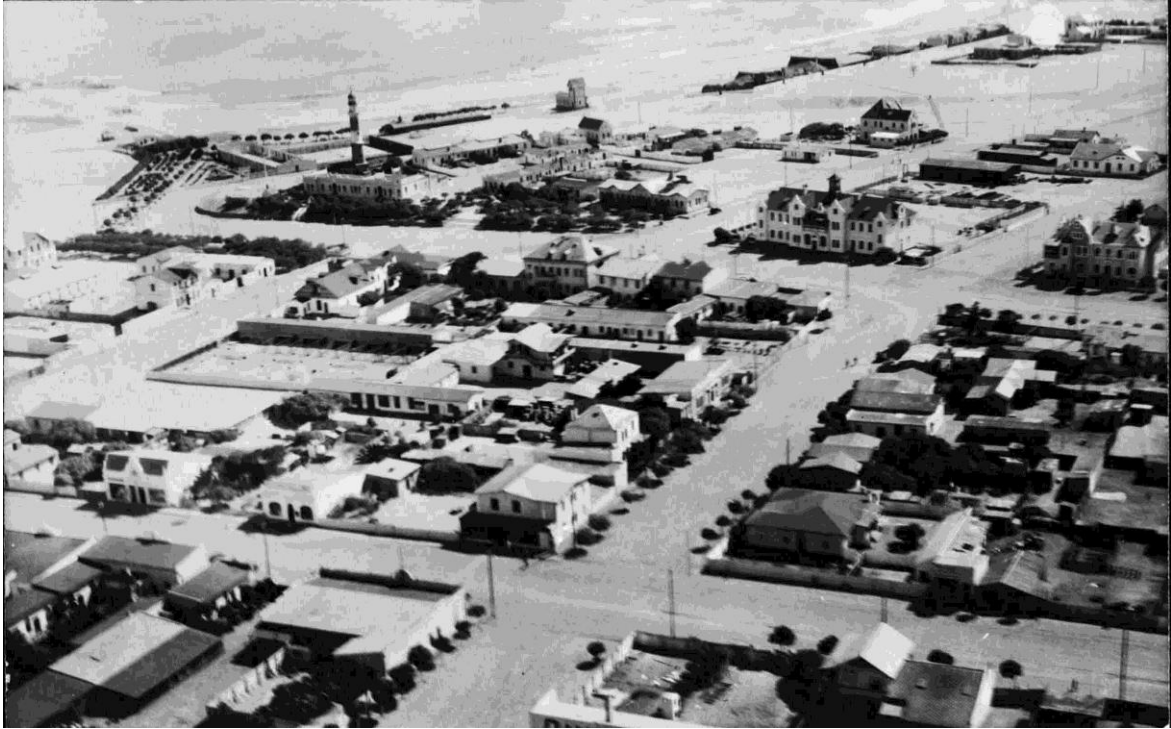
Swakopmund viewed from southeast, probably in the 1920's. The Badehaus is clearly visible; the custom goods shed is still in a ruinous shape. The Altes Amtsgericht, Bezirksamt and lighthouse are all clearly visible.