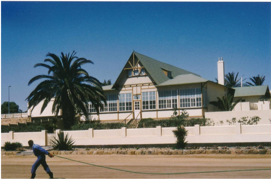
The old Vierkantvilla (app. 1998) shortly before its translocation to Mile 4