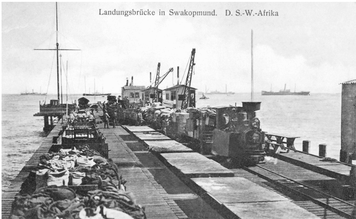
The old wooden jetty with its three steam cranes and railway tracks