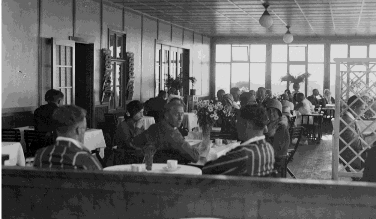
Inside the old Strand Café (app. 1930)