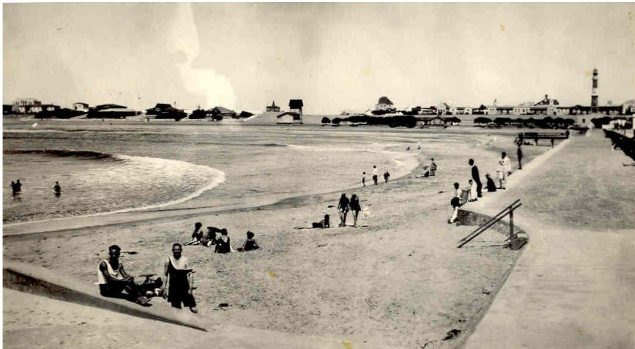
The mole harbour basin, probably in the 1930's; this time heavily silted up (perhaps after the floods in 1934). The Badehaus is again clearly visible.