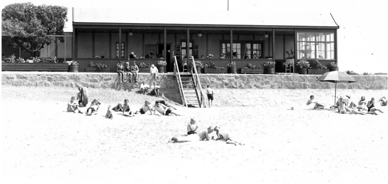
The old Strand Café (app. 1930)