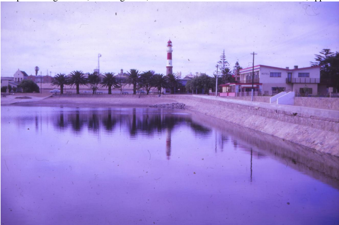
The harbour mole basin and the old Strand Hotel (app. 1959)