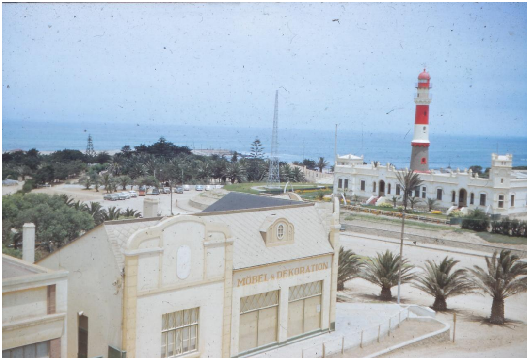
View of the harbour mole area (app. 1958). The customs shed is still ruinous; the palm trees are still relatively small.