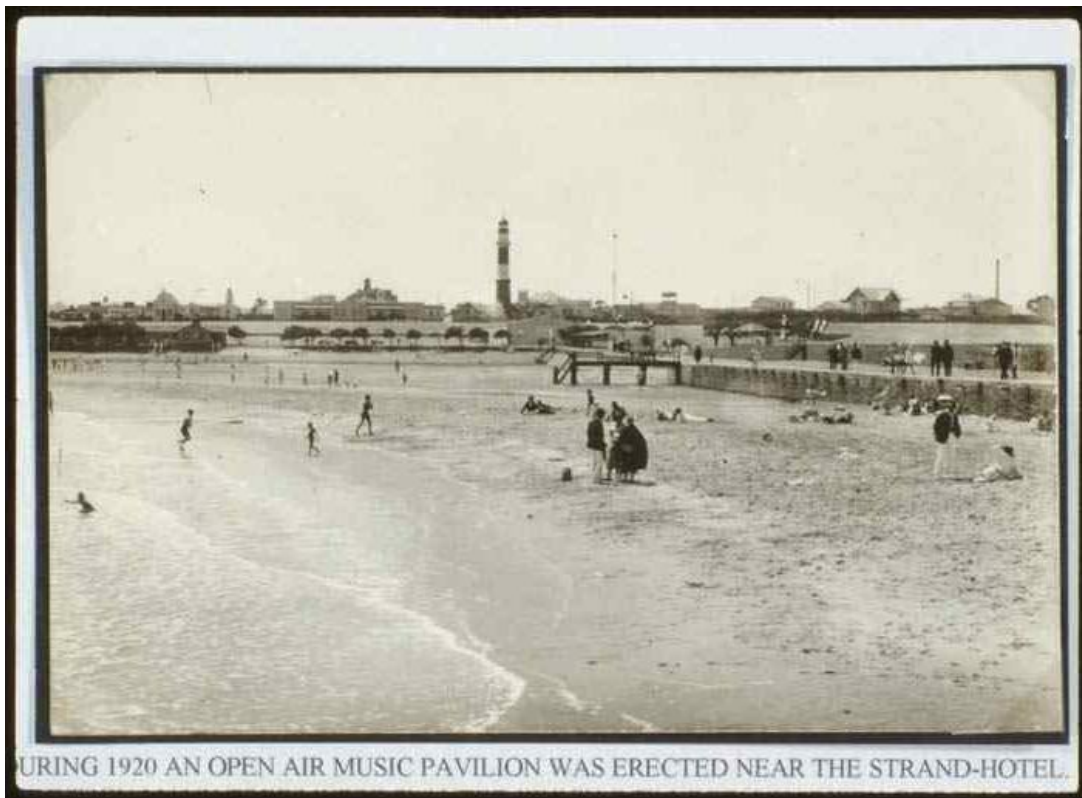
„During 1920 an open music pavilion was erected near the Strand Hotel.“