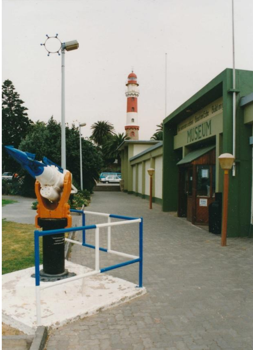
The entrance of the Swakopmund Museum, located in the old customs shed for the German colonial period, with the lighthouse in the background (1998)