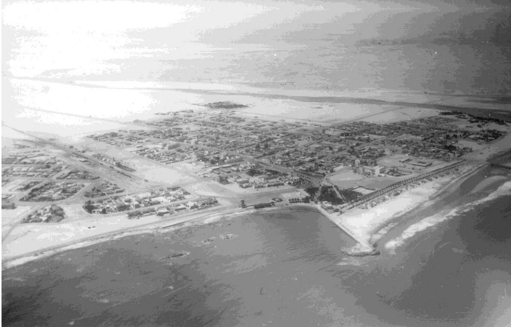
This picture of Swakopmund in 1930 clearly shows the mole harbour basin with the Badehaus featuring prominently in the foreground, the Vierkantvilla to the left, the lighthouse, the customs shed, the old Strand Café and the old harbour mole in the immediate foreground.