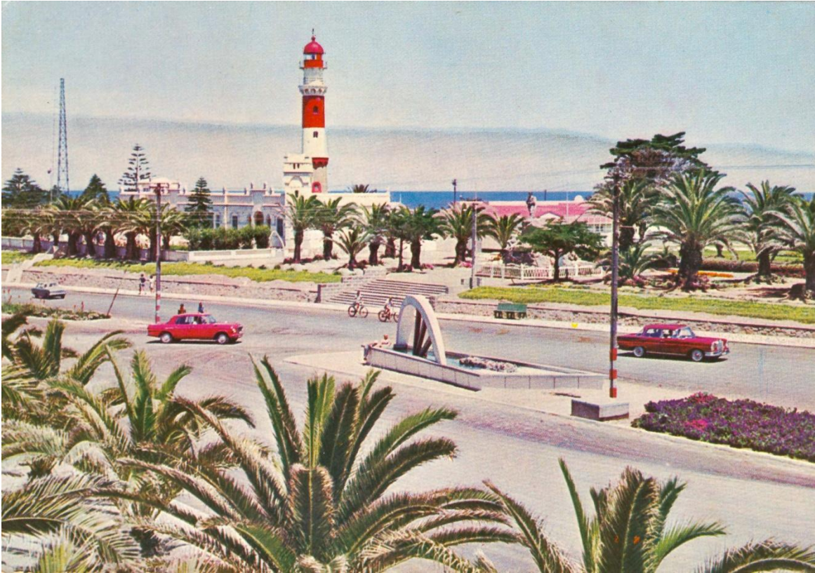
Swakopmund Lighthouse, Bezirksgericht, Intercontinental and Marines Monuments, app. 1970