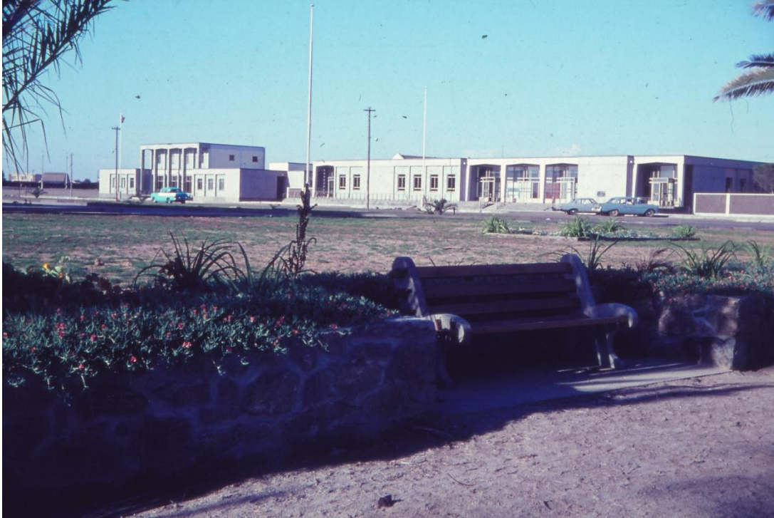
The new police offices and post office (app. 1960)