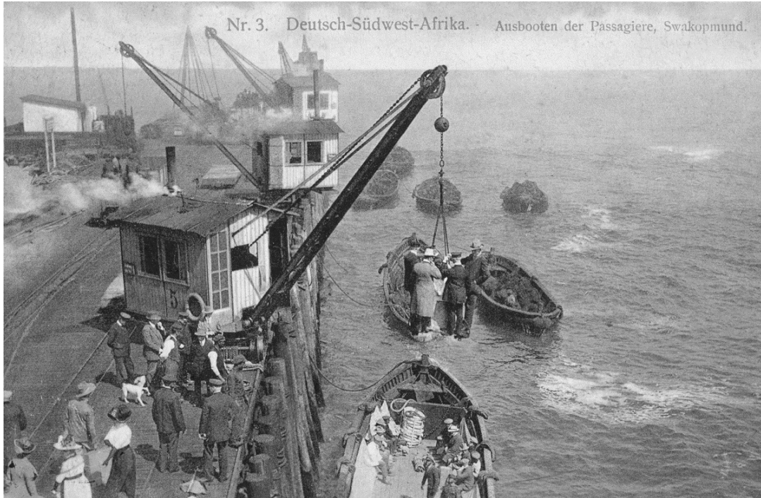
The old wooden jetty with its three steam cranes