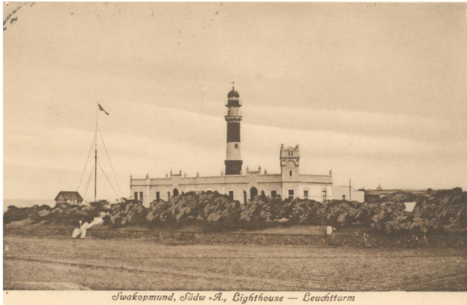
Swakopmund, Südw.-A., Lighthouse — Leuchtturm

The Swakopmund and old Bezirksgericht (later used as summer residence of the administrators, now presidential palace).